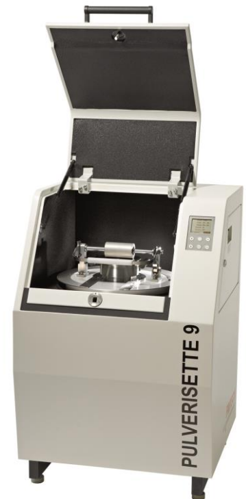
Vibrating Cup Mill PULVERISETTE 9

Accessories: We recommend hardened steel or chromium-free tool steel grinding sets for most applications. For extremely hard samples grinding sets made of hardmetal tungsten carbide should be used. For glass and ceramics are grinding sets made of zirconium oxide suitable and for soil samples agate grinding sets.